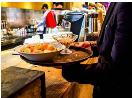
MinWage Graphics by KHOU on Scribd

Chadwick points to the expansion of self-checkouts, automated restaurants, and stores like the new Amazon Go in Seattle, and the takeover of the movie rental industry by Netflix and Redbox as proof that human employees can easily be replaced when the cost of employment is too high.